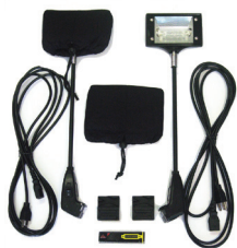
*Optional 200 watt halogen lights